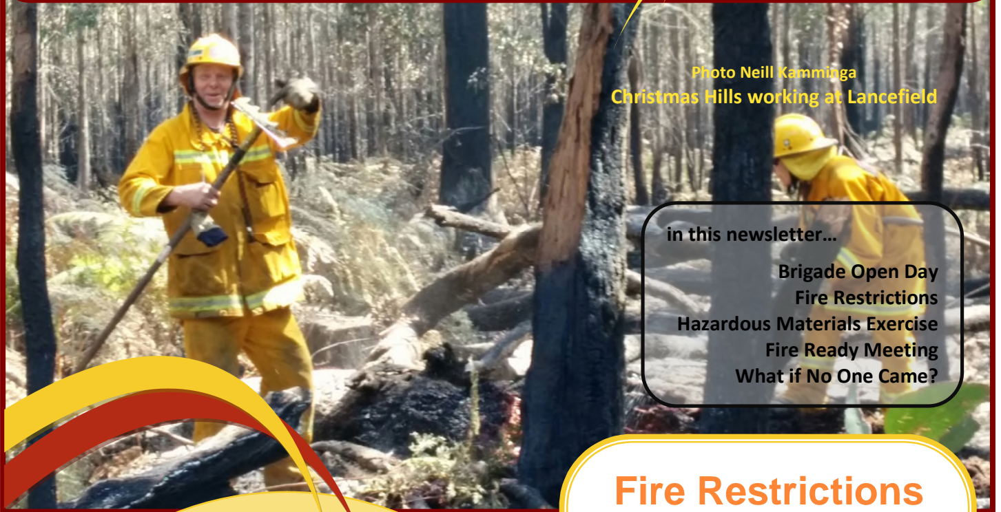
Christmas Hills working at Lancefield